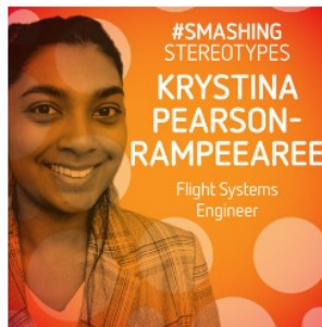
Encouraging more women into STEM, one badge at a time