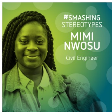
Building bridges for women in engineering

something that we were going to explore and help to change. We used ' Smashing Stereotypes ' - a collection of over 40 stories from individuals and teams - that challenge long-standing stereotypes, with the aim of encouraging more young people, from all backgrounds, to see themselves as scientists. Using these resources including profiles of chefs, product designers, and fitness professionals, to showcase how science is for everyone: whatever your interests, background, or career path. We want our children to ' connect ' with real scientists and to raise their aspirations.